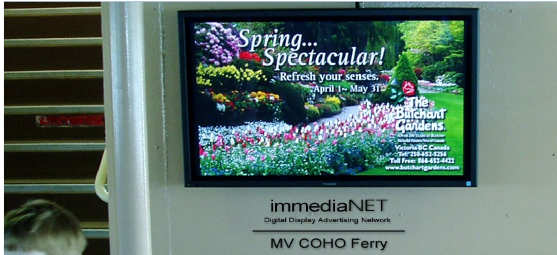
50" Plasma screen, Main Lounge, Coho Ferry

Immediate Images Inc. is pleased to present a unique advertising and marketing opportunity. Immediate Images has a Digital Signage Network in Western Canada, including a 50" Plasma screen onboard the Coho Ferry in the main seating area, and the first Video Wall on Vancouver Island, a 1x3 46" LCD wall in the Coho Terminal...providing a rich image, dynamic media platform for digital advertising and marketing messages to tourists in a very visual and influential way.